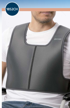
Sizes* S/M L/XL CLOSED VEST