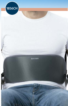
Sizes* S/M L/XL BASIC BELT