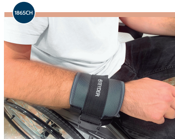
WRIST HARNESS One Size

1858CH available accessory STRAP EXTENDER One Size