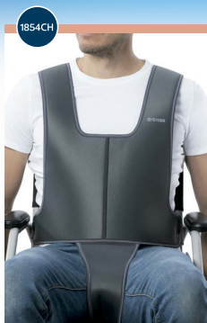
Sizes* S/M L/XL FULL PERINEAL VEST