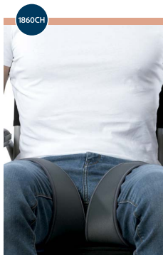
Sizes* S/M L/XL LEG ABDUCTOR