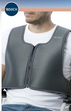
Sizes* S/M L/XL ZIPVEST